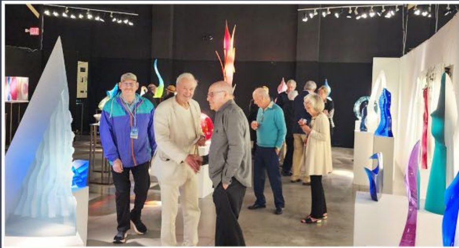
Glass Coast Weekend 2024

This is Florida's glass event of the year! Space is limited so make sure you RSVP and sign up to join in the celebration!